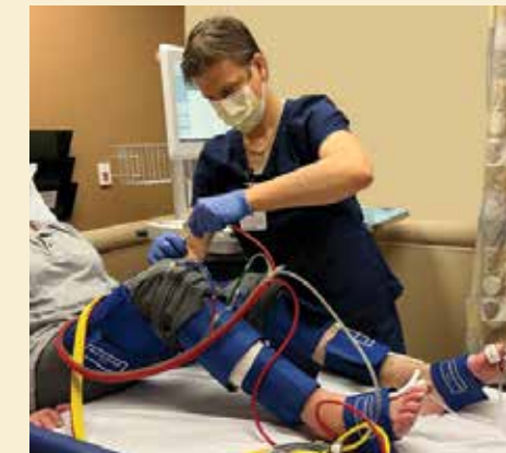
UPMC Passavant's new VascuLab™ tests the quality of blood flow, which can affect the healing of wounds.