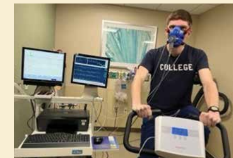
The cycler ergometer in the Advanced Cardiopulmonary Physiology Lab at UPMC Passavant helps diagnose a variety of breathing problems.