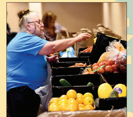
Volunteers at the North Hills Community Outreach food pantry in Millvale distribute fresh fruits and vegetables to low-income families and elderly adults.