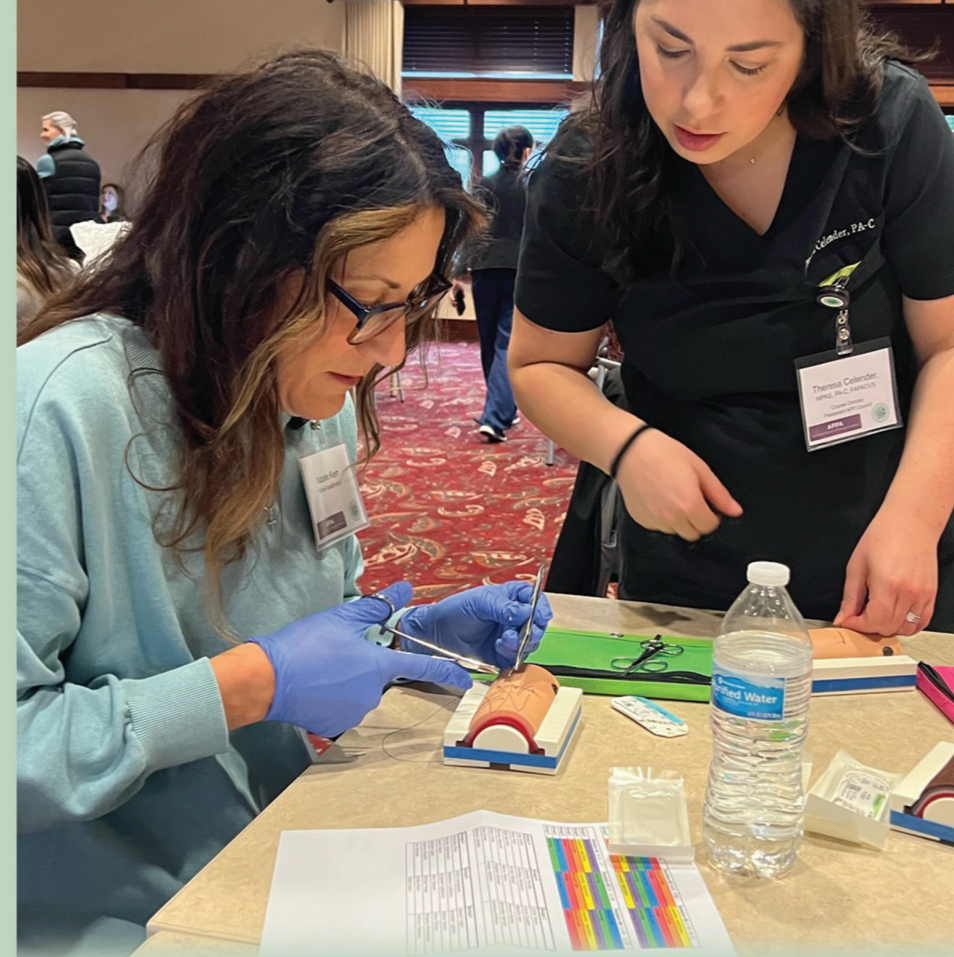
During the annual APP Academy at UPMC Passavant, Advanced Practice Providers (APPs) engage in two days of lectures, hands-on training, and expert panel discussions to sharpen their skills and stay abreast of the latest medical advancements.

While the demand for health care services continues to increase across the United States, the number of active physicians is decreasing. One solution to this dichotomy lies with Advanced Practice Providers (APPs).